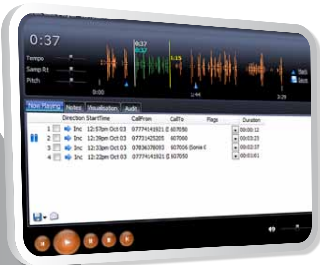
Play - Review calls visually within Oak's media style call player.